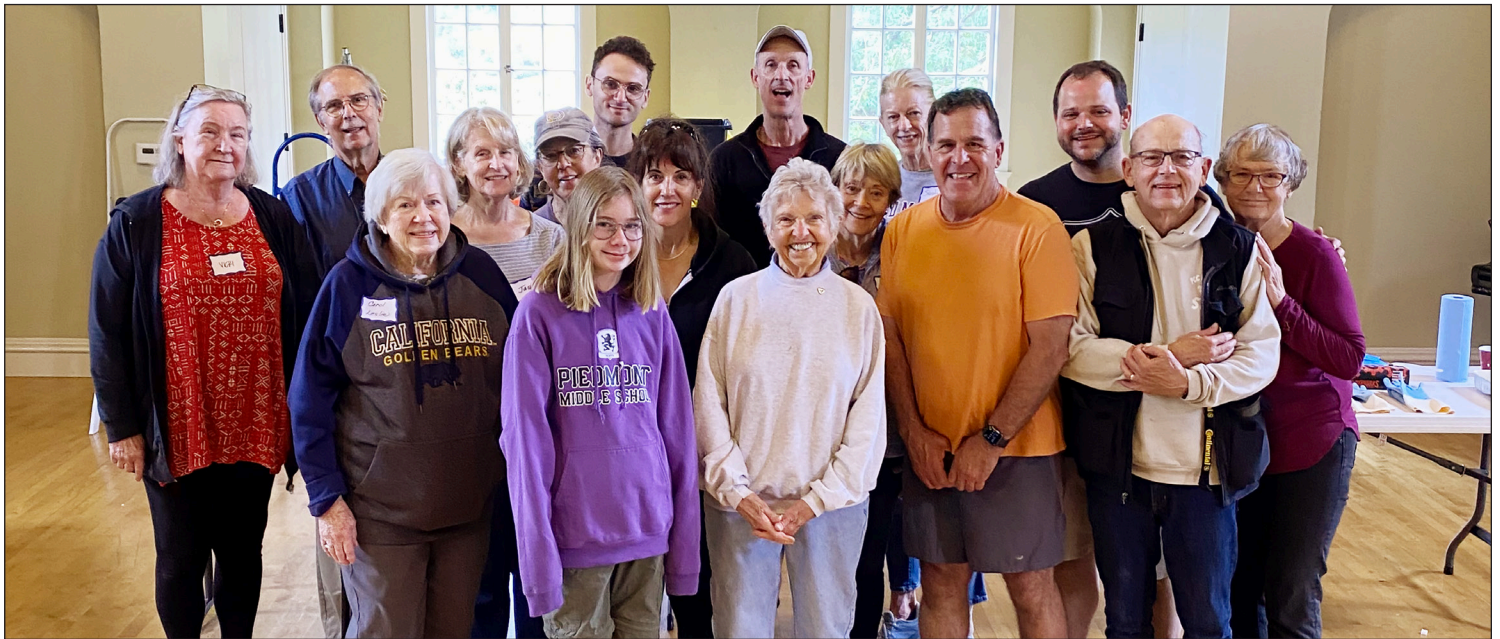
A group of church members and friends gather in Guild Hall for a photograph after completing an April Work Day event, sprucing up the church grounds, window cleaning and refinishing Courtyard benches.