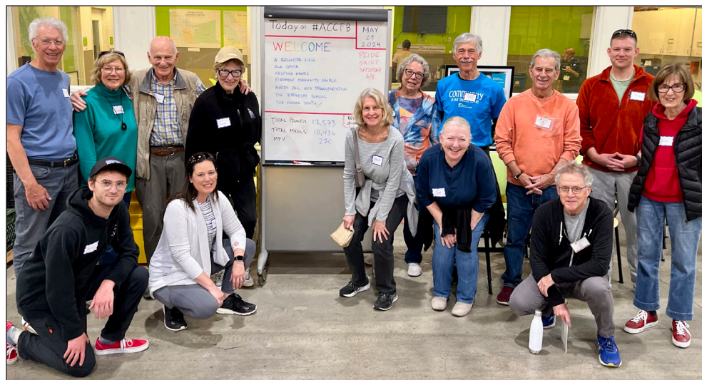
Service to community is an integral part of Piedmont Church life. This group assembled meals for Alameda County community Food Bank in May.